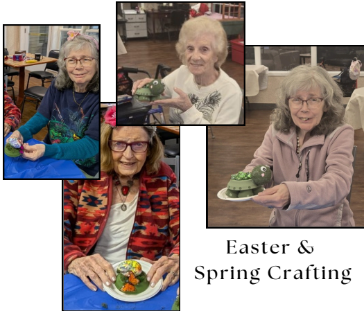
Easter & Spring Crafting