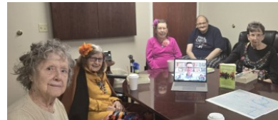
Meet the Author during book Club