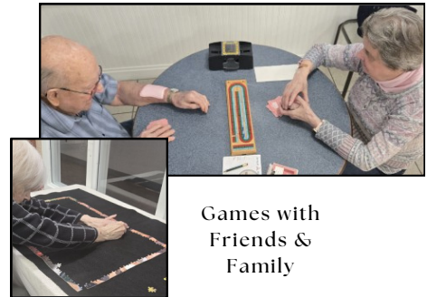
Games with Friends & Family