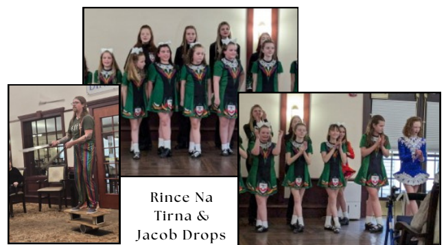
Rince Na Tirna & Jacob Drops