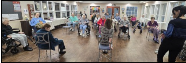
Keep Moving with Kippa